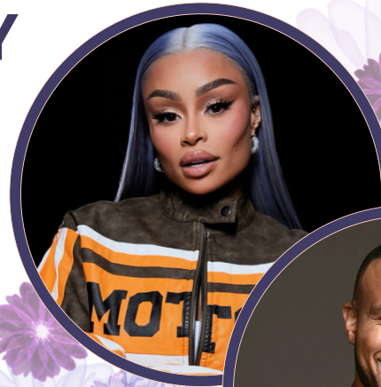
Angela White @blacchyna

We are so thrilled to announce special guest Angela White (Blac Chyna) will be joining us! Not only will she be celebrating an awesome milestone of 2 years of sobriety, but she will also be sharing her powerful journey as a guest speaker. Additionally, we are proud to announce our newest Honorary Chair, DEVon Franklin whose mission is to inspire wellness and help others reach their potential.