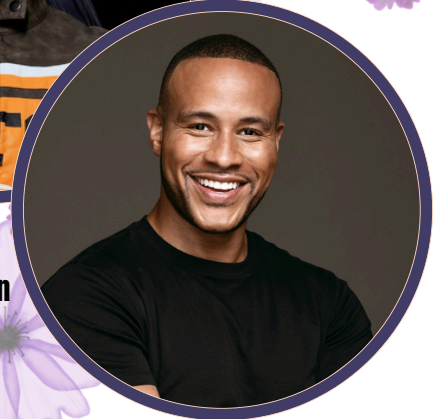
DEVon Franklin @devonfranklin

*click on their pictures to see their social media